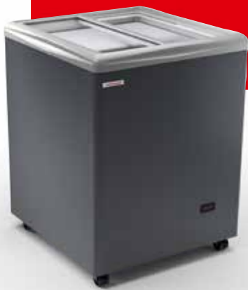
SAO PAULO H68

SAO PAULO can be accessed from all sides and provides the ideal solution due to its different variants.