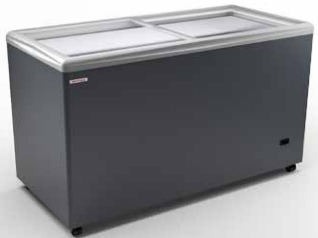
SAO PAULO H150