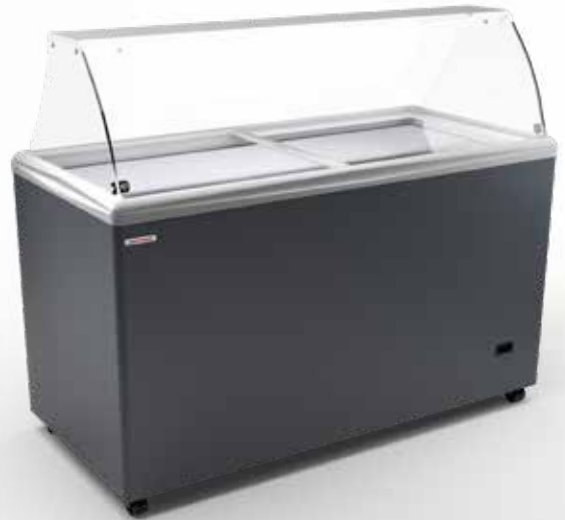
SAO PAULO H150 SCOOP