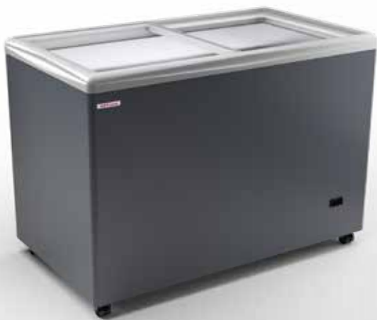
SAO PAULO H125