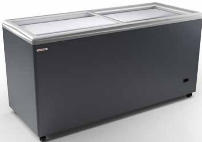
SAO PAULO H175