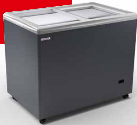
SAO PAULO H100