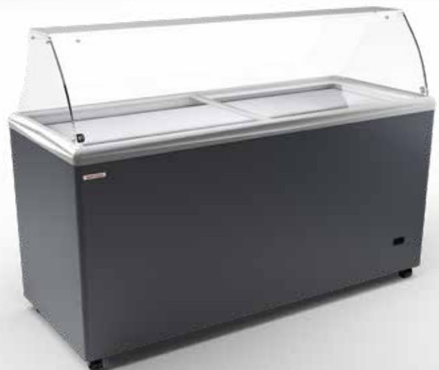
SAO PAULO H175 SCOOP