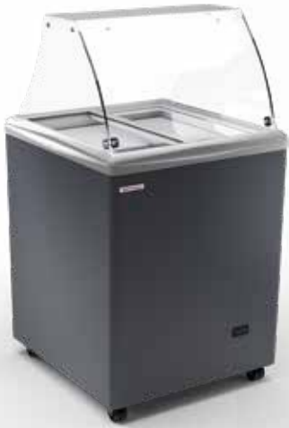
SAO PAULO H68 SCOOP