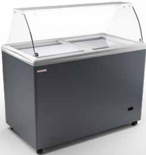
SAO PAULO H125 SCOOP