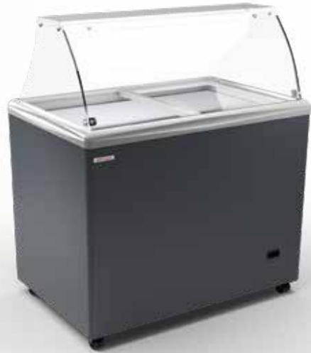
SAO PAULO H100 SCOOP