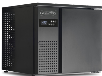
Mod. BASIC TRAY MINI