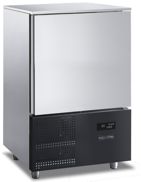
Mod. BASIC TRAY 10