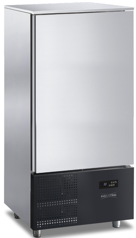
Mod. BASIC TRAY 15