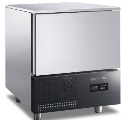
Mod. BASIC TRAY 05