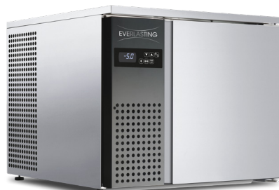
Mod. BASIC TRAY 04