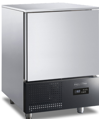
Mod. BASIC TRAY 07

tel.: +64 9 970 1019 e-mail: sales@fixwell.co.nz